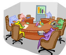
Your Eastbluff Board meets monthly to conduct association business.