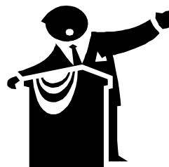
Homeowners turned out in modest numbers at the Annual Meeting on June 3, 2003.