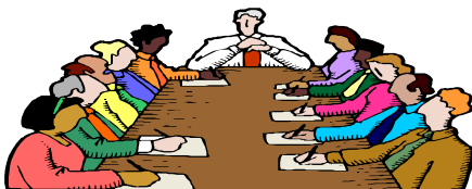
Eastbluff Board Member Named To The Newport Beacon City Planning Commission